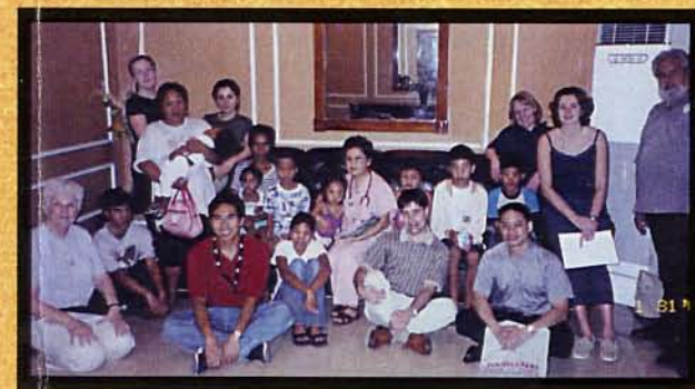
HOPE Foundation International patients with doctors, nurses, and volunteers.

The physicians donated their time, which was up to 15 hours of work on each child. The hospital graciously allowed each child free room and meals, and no charge was made for the use of the operating room. However, many other expenses were incurred including medicines, anesthesia, and surgical supplies. The children also had to be kept in the area for follow-up after discharge from the hospital. Most of them lived high in the mountains in areas without transportation readily available.